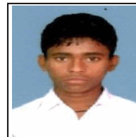
Photo of the Candidate